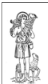
Catechesis of the GOOD SHEPHERD

We are proud to offer all 3 Levels of this program to the children in our parish! CGS nurtures the relationship between two mysteries: God and the Child. The CGS program was developed by two Roman Catholic laywomen in Rome, and is not a traditional style classroom. The program includes time in the "Atrium," which is a quiet environment. This Montessori-style classroom is prepared for the children to move about, touch materials, discover and develop a relationship with Jesus, the Good Shepherd. They understand this as a special place, preparing them to respect the Sanctuary as a sacred space. Consistent attendance is important so that there aren't any gaps in a child's learning process. Just like school, each year and level are a continuation from the year before.